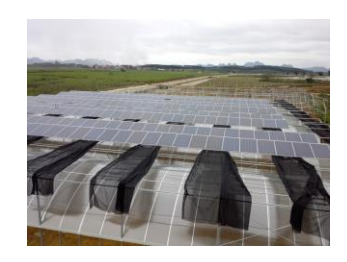
Industrial Pump Applications